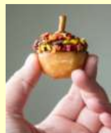
acorn DONUT HOLES