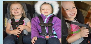
Correct Incorrect After Coat Compression

As we're going through our coldest and snowiest season of the wonderful Minnesota weather it's important to keep our children safe and warm inside their car seats. The biggest way we can keep them safe is to NOT put a thick and bulky jacket on them before strapping them into their car seat. If your child is wearing a thick jacket it can result in the harness being too loose so it may not be effective if there were to be a crash or accident. A few ideas of things you could do to still keep them warm in the car are: 1) after securing your child in their car seat, turn their jacket around so their arms will still go in the arm sleeves and keep them warm 2) after securing your child in their car seat, cover them up with a blanket. Of course our hopes are that there would never be any sort of accident but it's important to have good car safety for everyone and to do whatever we can to keep the precious little ones safe.